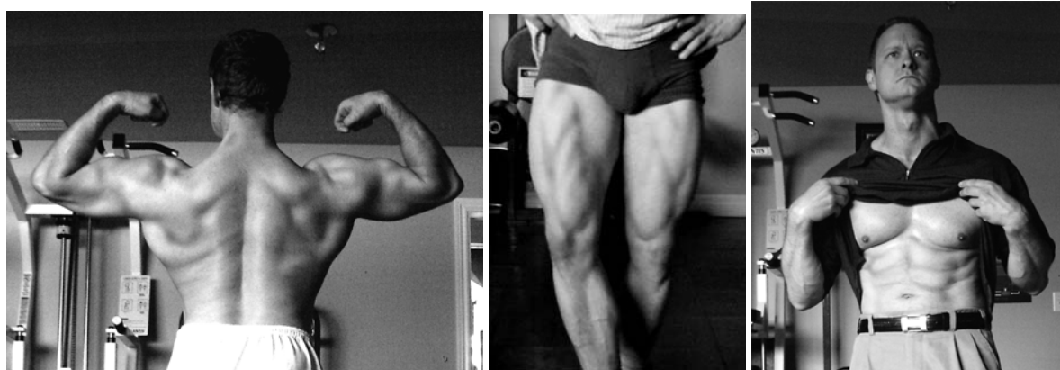
Photos 1-3 of Subject 1 at age 40 show the musculature achieved from brief, intense and heavy exercise, but which exercise did little to maintain or increase the strength of his lumbar muscles.