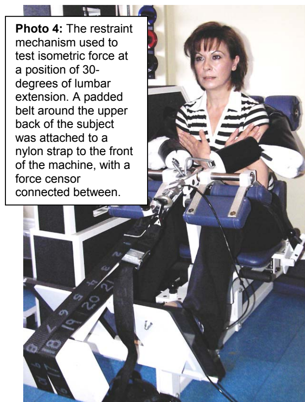
Photo 4: The restraint mechanism used to test isometric force at a position of 30-degrees of lumbar extension. A padded belt around the upper back of the subject was attached to a nylon strap to the front of the machine, with a force sensor connected between.

Subject 2 (age 52) is a long-time fitness enthusiast, who competed in bodybuilding, and more recently in firefighter combat challenges (he set a Canadian record for age 50-60, by completing the competition in 2 minutes and 5 seconds). With over 30 years of intense strength training and bodybuilding, as well as continual training for firefighter conditioning and competition, it would be expected that his lumbar muscles are very strong or, at least, above normal.